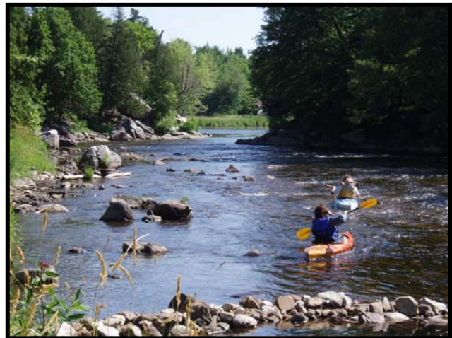
Playing in the Playfair Rapids on Canada's magical Mississippi River.

Km. 57.0 (44° 00.955'N. 76° 21.752'W.) At STOP Sign, turn right in village of Lanark, a Scottish heritage mill town once using the might of the Clyde River. Wide variety of shops and services including nearby Community Health Centre.