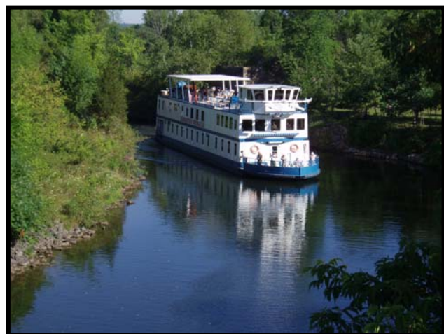
Kawartha Voyager in the Newboro Channel