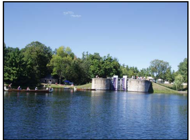
Just one of the great locks at Jones Falls. Come back to see and enjoy all of Jones Falls.

Option: Turn Left onto Davis Lock Rd. and explore this country lane (about 5 km.) to its destination. Davis Lock is one of the most picturesque and rustic stations of the Rideau Canal. Return to your route along the same road.