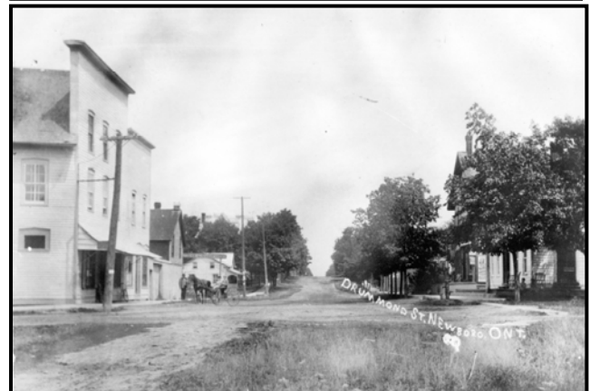
Newboro's Drummond Street as it was in wild past. But ne'er a gunfight at the OK Canal! Now the streets of Newboro are paved, but not with gold