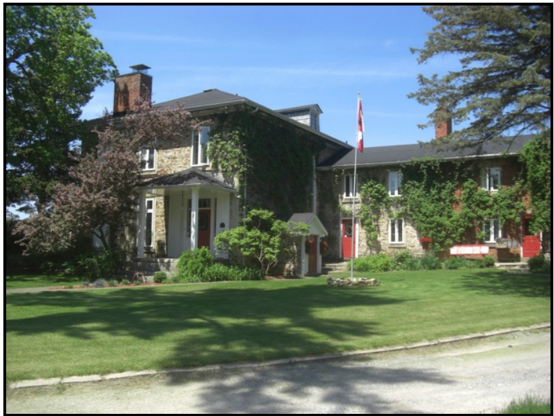
Denaut Mansion Country Inn

Historic Old Stone Mill, a National Historic Site Denaut Mansion Country Inn, The Great Escape 613-928- 2588 Lower Beverley Lake Park, Camping and Cottages 613- 928-2881 Restaurants, stores, library and L.C.B.O.