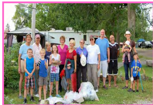
Photo: 2016 Lake Clean-Up Volunteers

The Lower Beverley Lake Association's Annual Picnic will be held on August 12 th in Kendrick's Park starting at 3:00 p.m. Everyone is invited to join Association families for an afternoon of food and fellowship. Bring a dish of food to share; hot dogs will be provided.